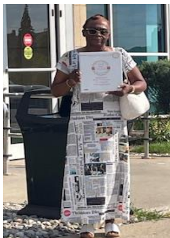
HERE IS NADIE MAILING OUR SUBMISSION

CONGRATULATIONS NU-LITE FOR RECEIVING BEST PRACTICE ~ STRIVING