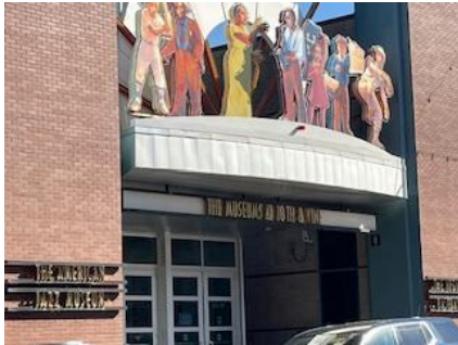
We visited the Black History Museum