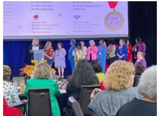
Nadie recognized for Leveling Up